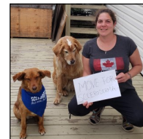
Fort Mac, AB